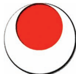
The In/Yo or Yin/Yan Symbol