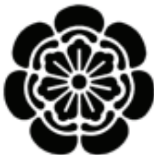
The Hyouka Kamon