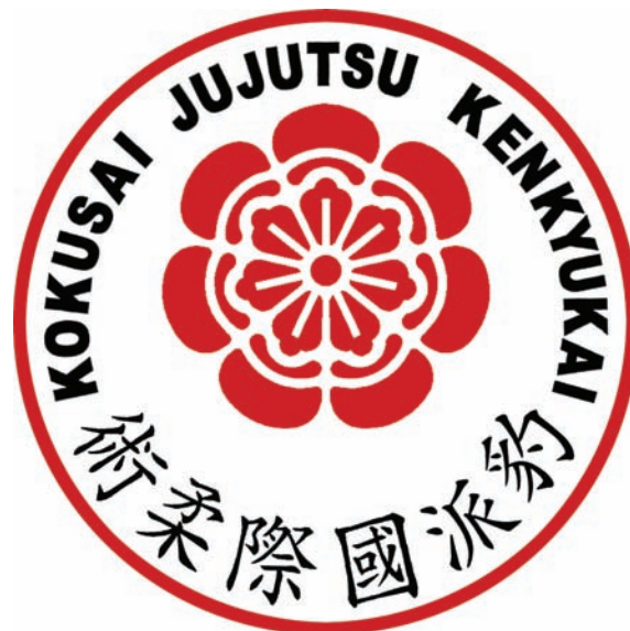
Our current Lapel Badge

This badge design incorporates the hyouka kamon within a circle and is intended to be reminiscent of the Japanese in/yo or ying/yang symbol.